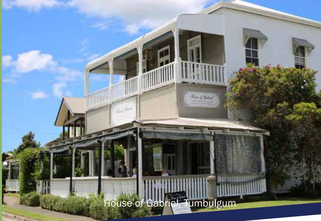
House of Gabriel, Tumbulgum

Freecall 1800 674 414 destinationtweed.com.au